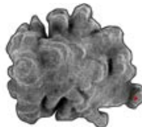
The Seat of Leaving