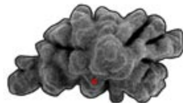
The Rest of Weepers