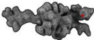
The Tor Of Natural Causes