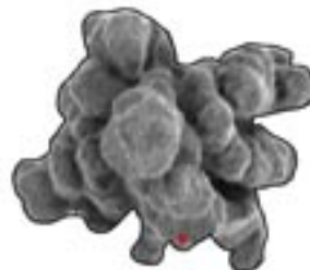
The Ledge of Leaping Faiths