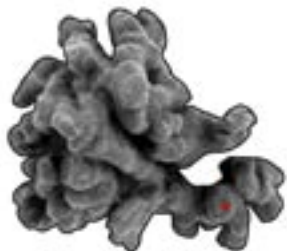
The Throne of Unknowing